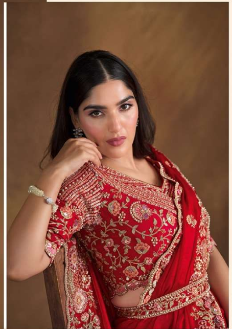
24710 Fabris : Two tone Satin Silk Blouse : Hand Work Embroidered