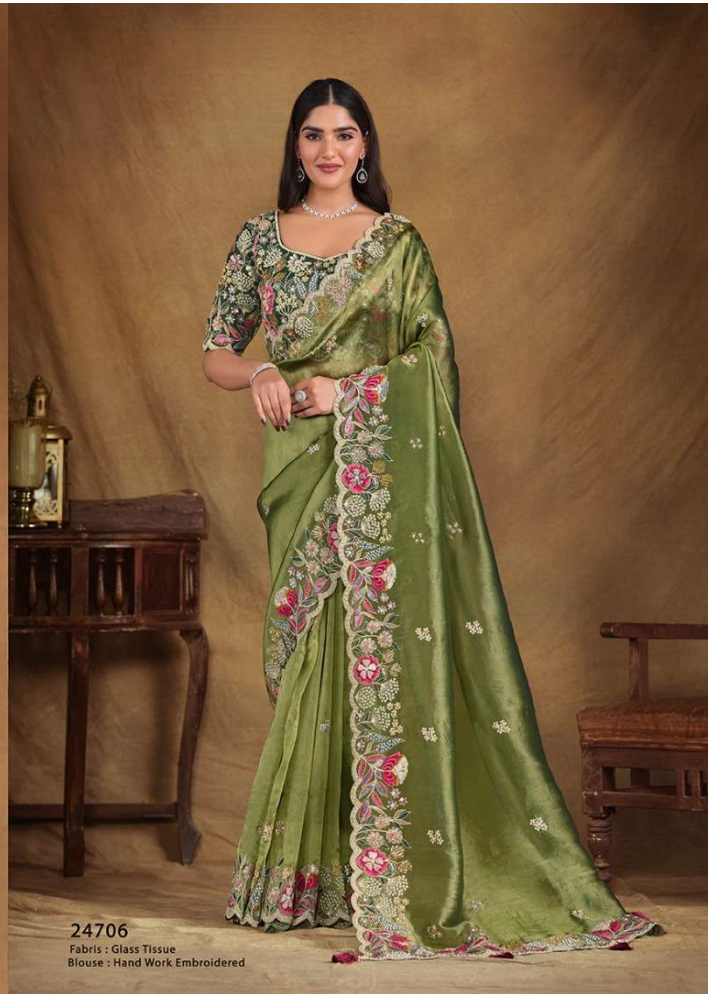
24706 Fabris : Glass Tissue Blouse : Hand Work Embroidered