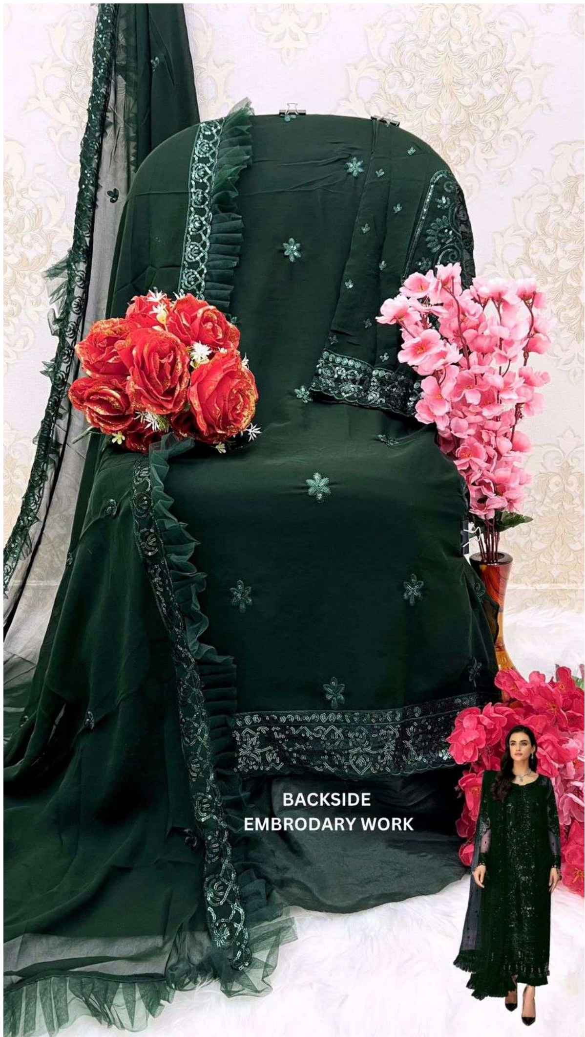
BACKSIDE EMBROIDARY WORK