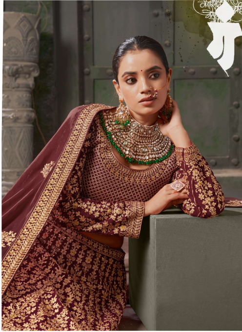
Overdressed and undercharged in this stunning lehenga D.no-12002-B