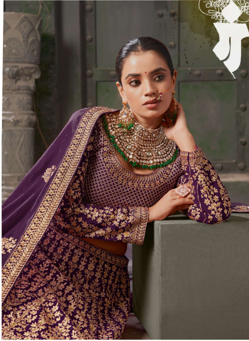
Overdressed and undercharged in this stunning lehenga D.no-12002 C