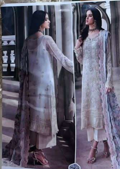
GULAAL VOL-1 TOP Faux Georgette with Embroidery ZAHA DUPATTA Dull santoon D.No.1