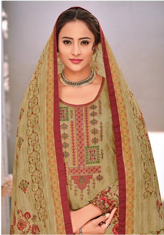
NAITRA | 104