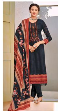
NAITRA | 109