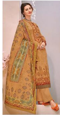
NAITRA | 106