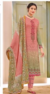
NAITRA | 110