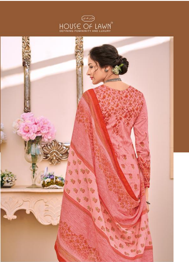
NAITRA | 103