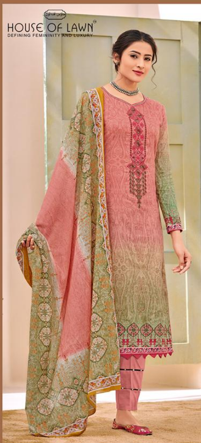
NAITRA | 110