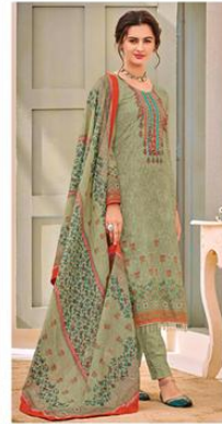
NAITRA | 107