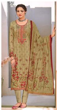
NAITRA | 104