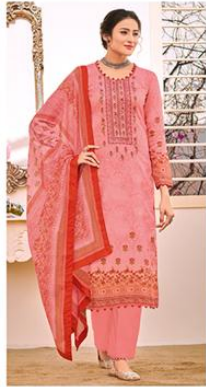
NAITRA | 103