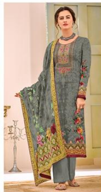
NAITRA | 105