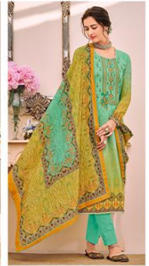
NAITRA | 108