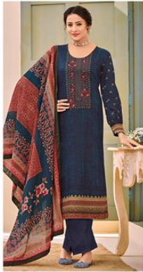
NAITRA | 101