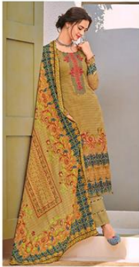
NAITRA | 102