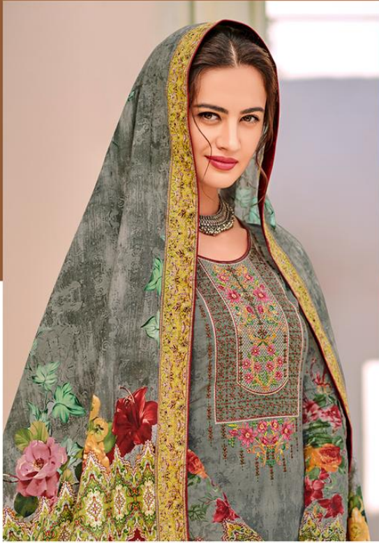
NAITRA | 105