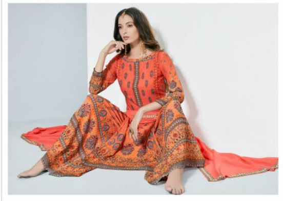
You a collection designed with I dress for the image, not for myself, not for the public, not for fashion, not for men. Fashion is stant language. D.No.8601