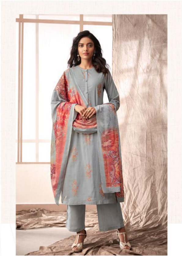
1072 Royal MATE