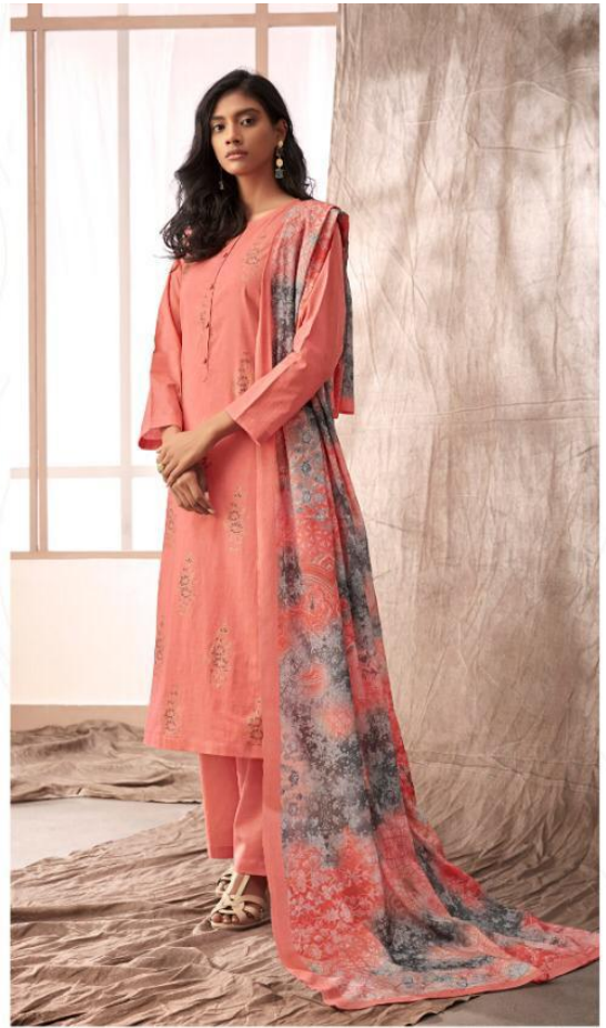
1011 Royal MATE