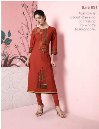
D.no 851 Fashion is about dressing according to what's fashionable.