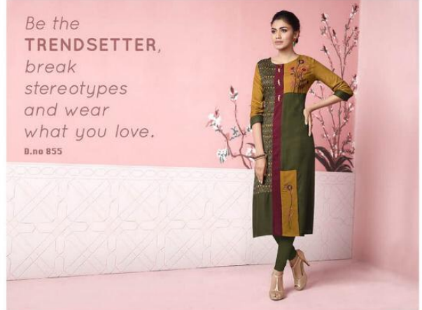
Be the TRENDSETTER, break stereotypes and wear what you love. D.no 855