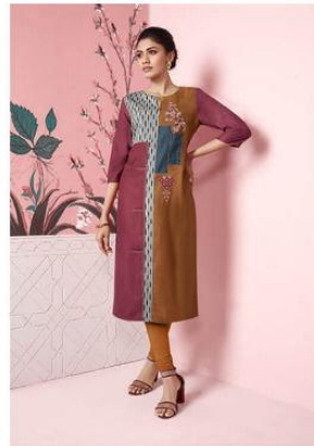
Style isn't just what you wear, it's about how you live. D.no 853