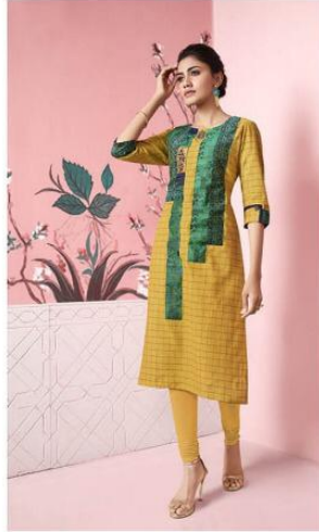
D.no 852 BEAUTY begins the moment you decide to be yourself!