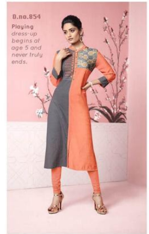
D.no.854 Playing dress-up begins at age 5 and never truly ends.