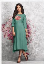
LOOK # 20030