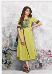
LOOK # 20028