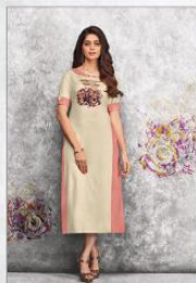
LOOK # 20026