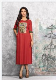
LOOK # 20027