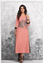
LOOK # 20029