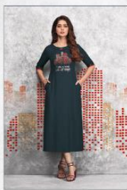
LOOK # 20024