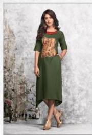
LOOK # 20025