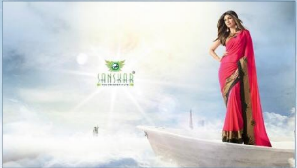
© 2015 SANSARA. ALL RIGHTS RESERVED.