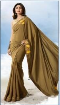
D. NO: 2559