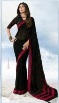
D. NO: 2558