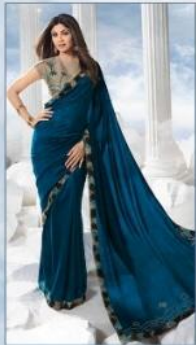
D. NO: 2557