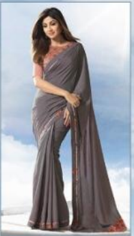
D. NO: 2553