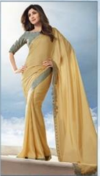
D. NO: 2556