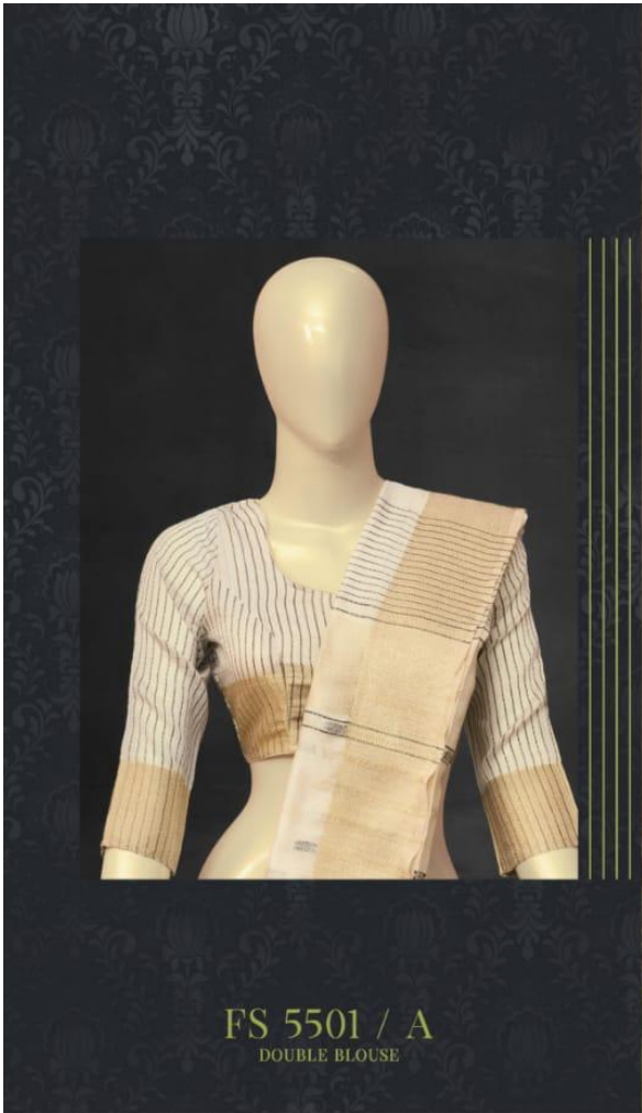
FS 5501 / A DOUBLE BLOUSE