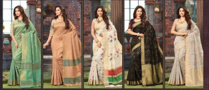
FS - 5503 / B