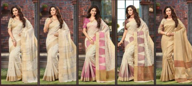
FS - 5501 / A