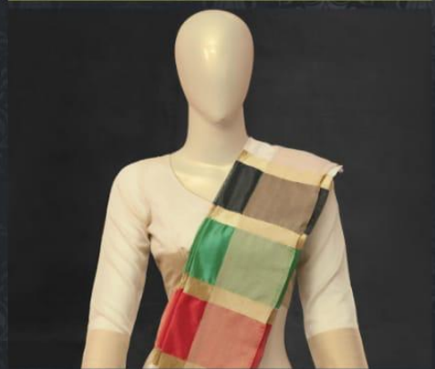
FS 5504 DOUBLE BLOUSE