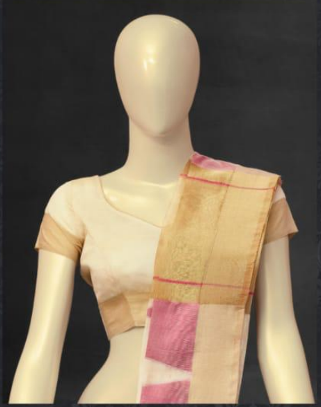
FS 5502 / A DOUBLE BLOUSE