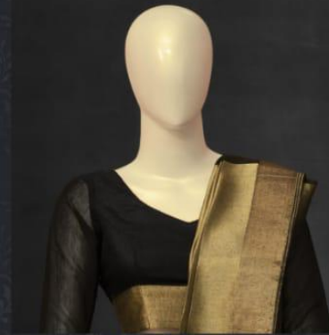
FS 5505 / A DOUBLE BLOUSE