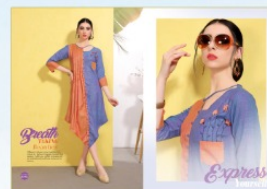
D. No. 1008