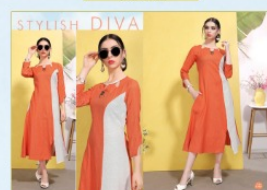
D. No. 1006