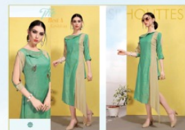
D. No. 1007