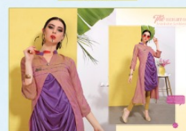
D. No. 1005