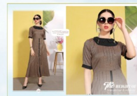
D. No. 1001