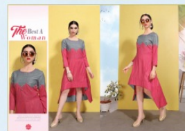
D. No. 1004