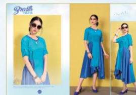
D. No. 1003