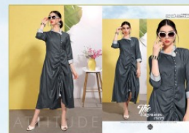
D. No. 1002