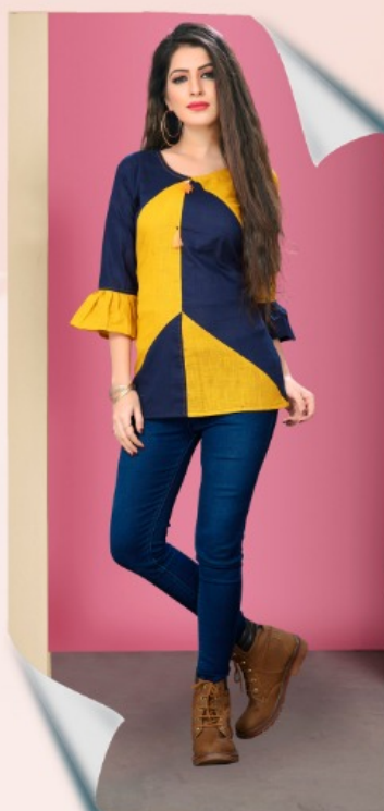
Code - 1805