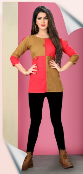
Code - 1803