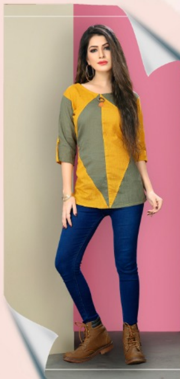
Code - 1802