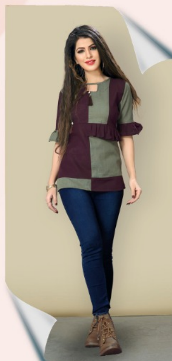
Code - 1806