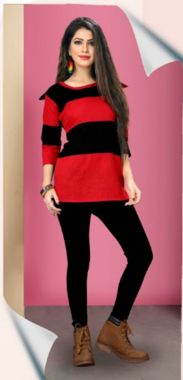
Code - 1801