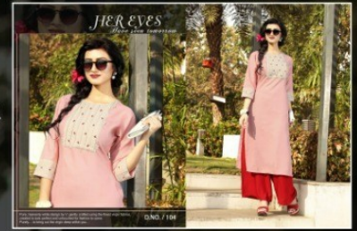
D.NO. / 104