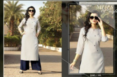
D.NO. / 105