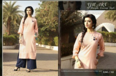
D.NO. / 102