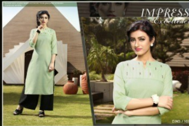
D.NO. / 103