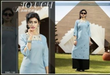
D.NO. / 101