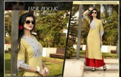
D.NO. / 106