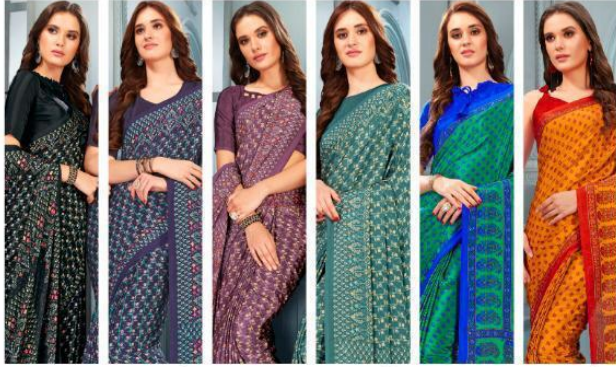
5804a 5804b 5805a 5805b 5806a 5806b