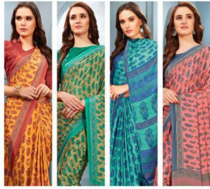
5803a 5803b 5803c 5803d