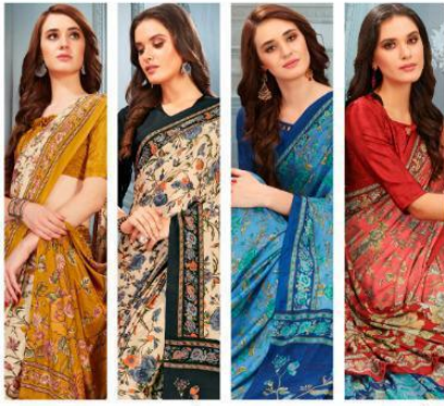
5801a 5801b 5802a 5802b