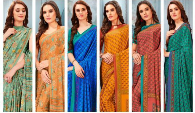
5807a 5807b 5808a 5808b 5808c 5808d