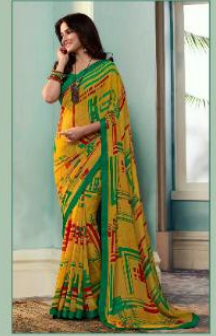
* 22030 *