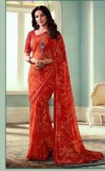
* 22027 *