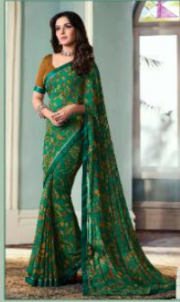
* 22025 *