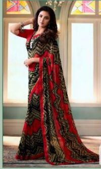
* 22024 *