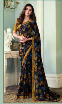
* 22029 *