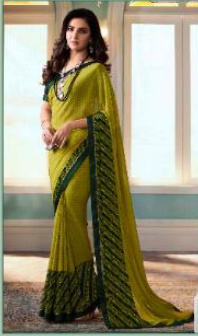
* 22023 *