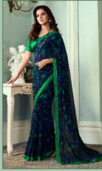
* 22021 *