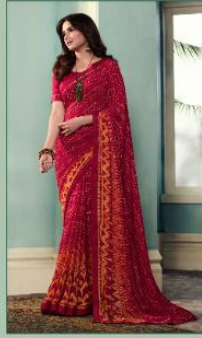
* 22022 *