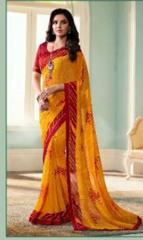
* 22026 *