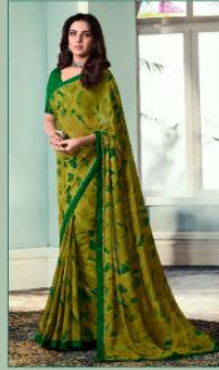
* 22028 *