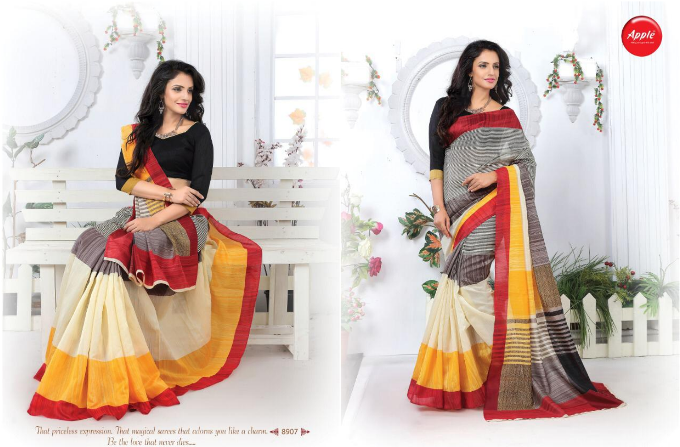
That priceless expression. That magical sarees that adorns you like a charm. ◀ 8907 ▶ Be the love that never dies....