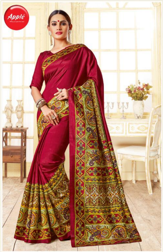
Get going with this magnificent & wonderful attire to make your personal look richer.