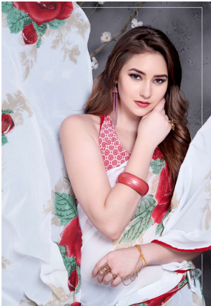
A DESIGNER SAREE...