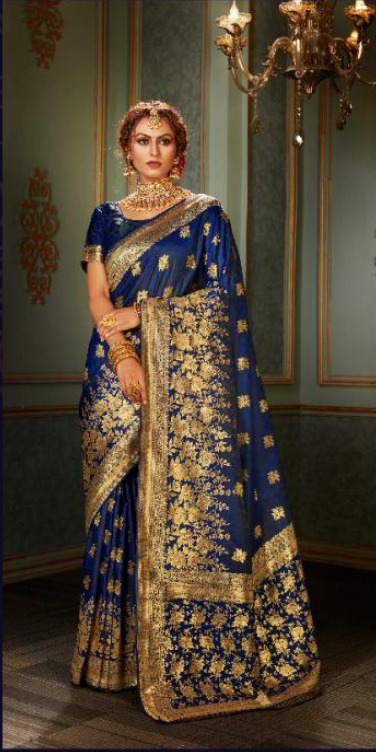
PERFECT BLEND OF STYLE AND ELEGANCE