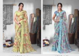
1505 // A