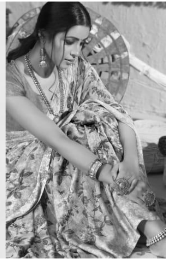
1510 // B