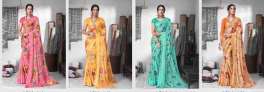
1501 // A