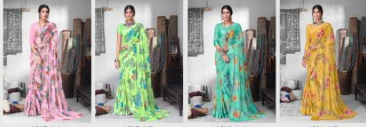
1507 // A