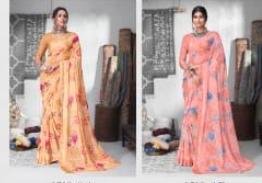
1510 // A