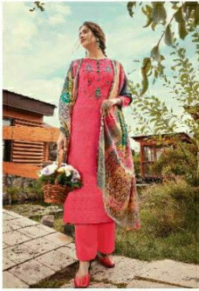
CODE # 1001