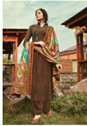
CODE # 1002