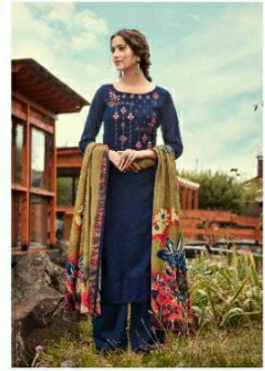
CODE # 1004