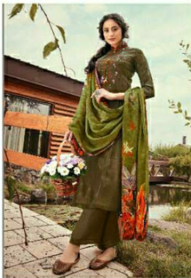
CODE # 1005