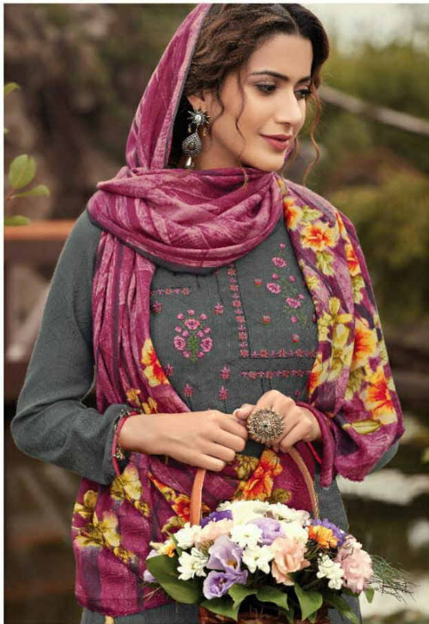
Now the style for women with true colors dress with eyes on being there & dazzling designs.