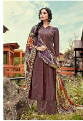
CODE # 1003