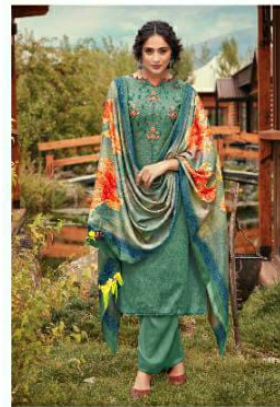
CODE # 1007