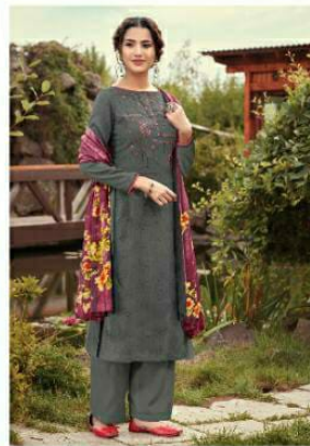
CODE # 1006