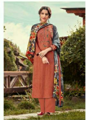
CODE # 1008