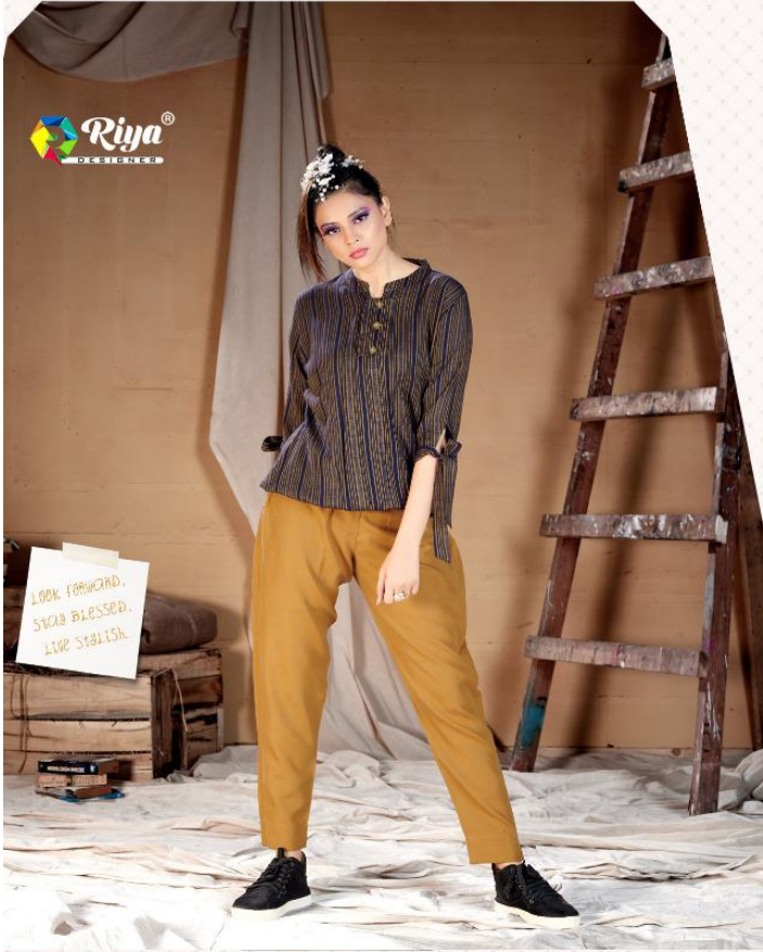
Style personality code 3003 Talking the Imagination Beyond Usual Colour Combination, this Suit Gives You Cozy & Beautiful Look in All The Urban of Shoulder...