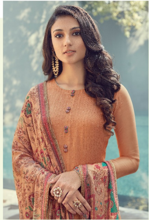
The Beauty of the Indian Woman with Gracefully Drapes in alluring Dresses 2094