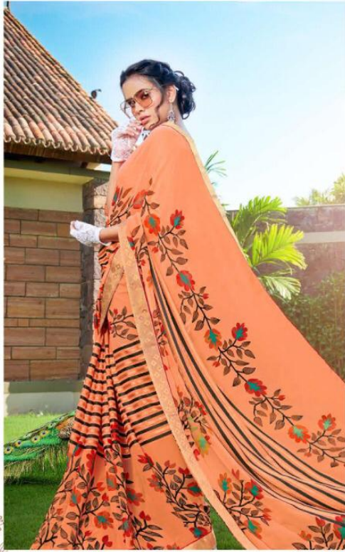
THE CONTRAST SHADES MINED UP TO OVER DO THE FEMININE QUOTIENT

ALLOW THE PAISLEYS TO GROW! YOUR WARDROBE ON CONTRAST SHADES