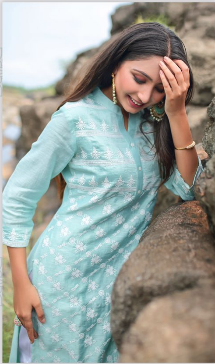
SHQV01 Sea Green - Dyed in a calming hue with embroidery, perfect for everyday wear.