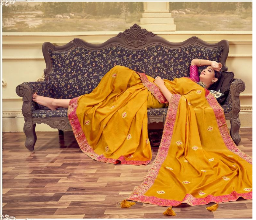
BLOOMING MUSTARD VICHITRA SILK SAREE WITH EMBROIDERED BUTTIES AND SWAROVSKI, HAVING BROCADE BODIES WITH SWAROVSKI WORK AND TUSSELS, PAIRED WITH RANI BROCADE BLOUSE