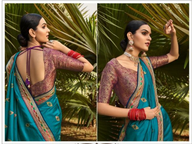
FEROZI BARFI SILK EMBROIDERED SAREE, HAVING EMBROIDERED LACES AND TUSSELS, PAIRED WITH WINE BROCADE DLOUSE