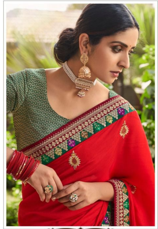
RED BANFI SILK EMBROIDERED SAREE, HAVING EMBROIDERED LACES AND TUSSELS, PAIRED WITH GREEN BROCADE BLOUSE.