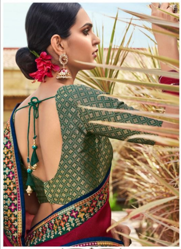
MAROON BARFI SILK EMBROIDERED SAREE, HAVING EMBROIDERED LACES AND TUSSELS, PAIRED WITH GREEN BROCADE BLOUSE