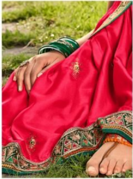
RANI BARFI SILK EMBROIDERED SAREE, HAVING EMBROIDERED LACES AND TUSSELS, PAIRED WITH GREEN BROCADE BLOUSE